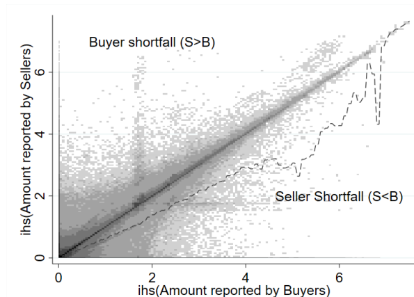
(A) VAT AMOUNTS DECLARED BY SELLERS VS BUYERS